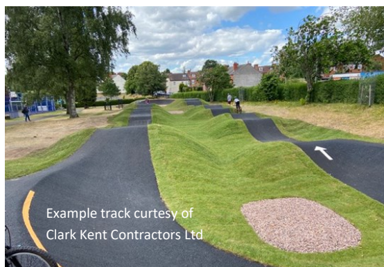
Example track courtesy of Clark Kent Contractors Ltd

If you would like more information, please contact groundsmaintenance@westberks.gov.uk