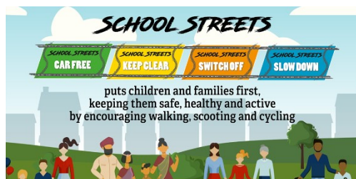
Berks AT Schemes – commonplace.

Although the opportunity to comment on our West Berks Active Streets and Calcot School Streets proposed schemes to make streets safer for walking and cycling closed on 23 rd April, you can still find out more about what School Streets schemes are by clicking on the video link here