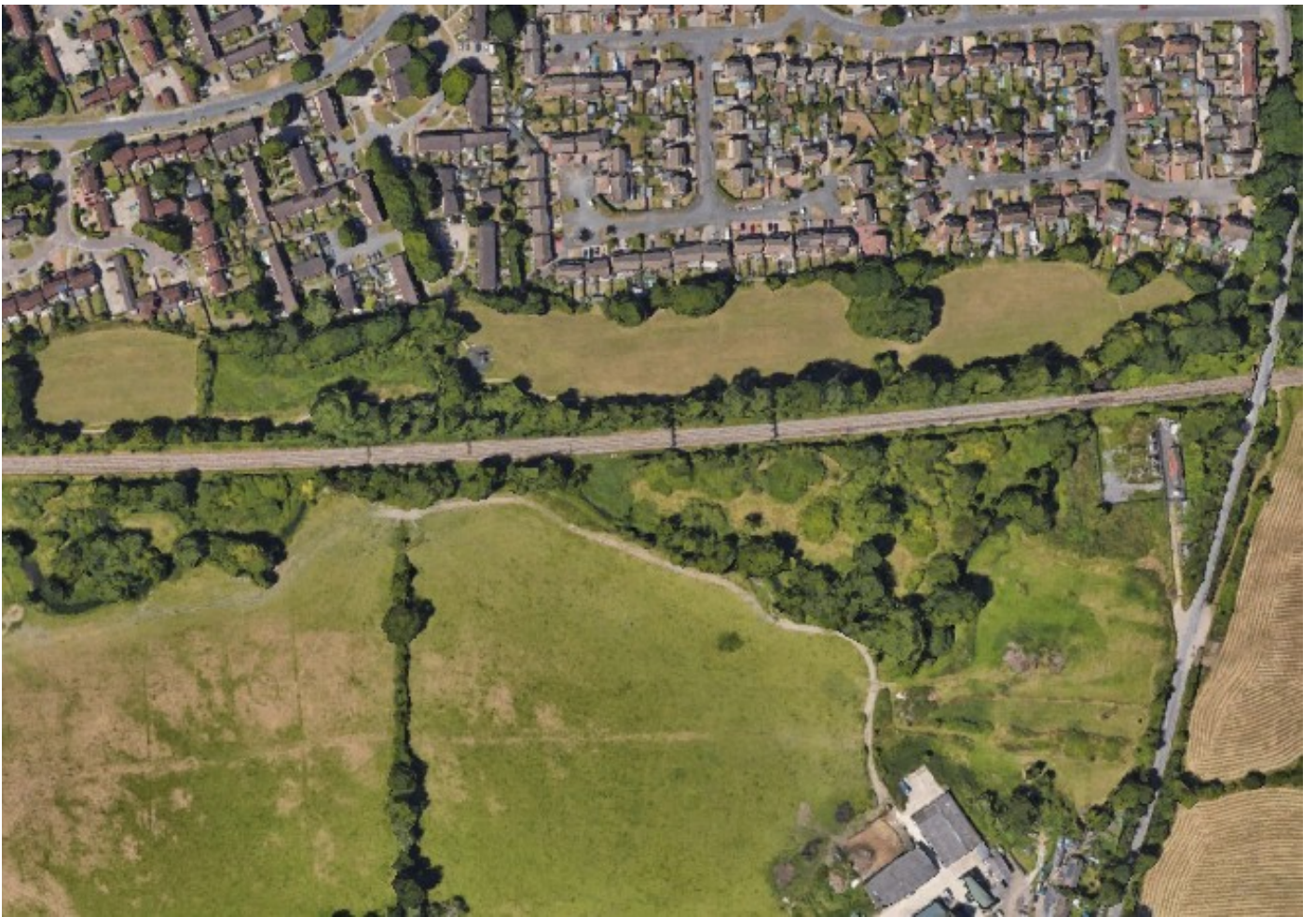
AERIAL MAP OF HOLYBROOK PARISH