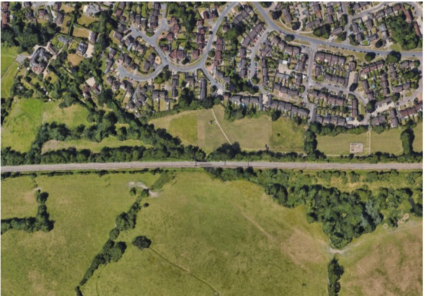
AERIAL MAP OF HOLYBROOK PARISH