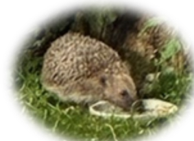
Miss Bette having an early evening drink, thriving after her first hibernation!

A hedgehog seen during daylight may be in trouble. Don’t pick it up, observe from a distance and contact your local rescue ASAP for guidance.