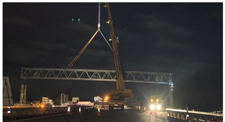
A 'Superspan' gantry installation during a recent closure