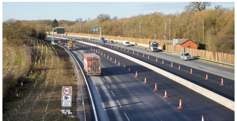
An example of the concrete barrier we will begin constructing in the central reservation between junction 5-6

Activity continues to take place between junctions 8/9 to 12. Work is taking place during overnight closures to protect those working in the road now that the metal construction barrier has been removed. We are grateful for the ongoing patience of our customers whilst we carry out this work.