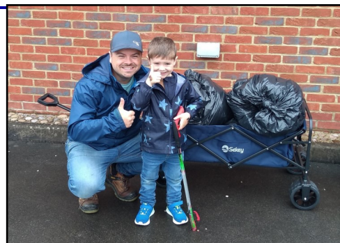
Two of our keen local residents with our new sack trolley

Unable to make an organised session? No problem, you can also borrow litter picking equipment on a casual basis to do some litter picking in your own small groups. Please contact the Parish Office for details.